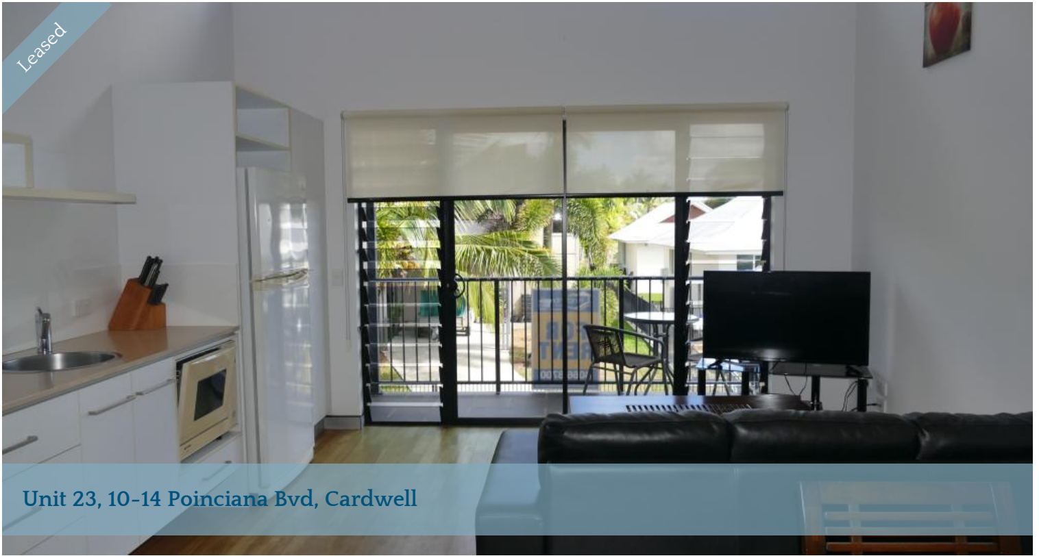
Unit 23, 10-14 Poinciana Bvd, Cardwell