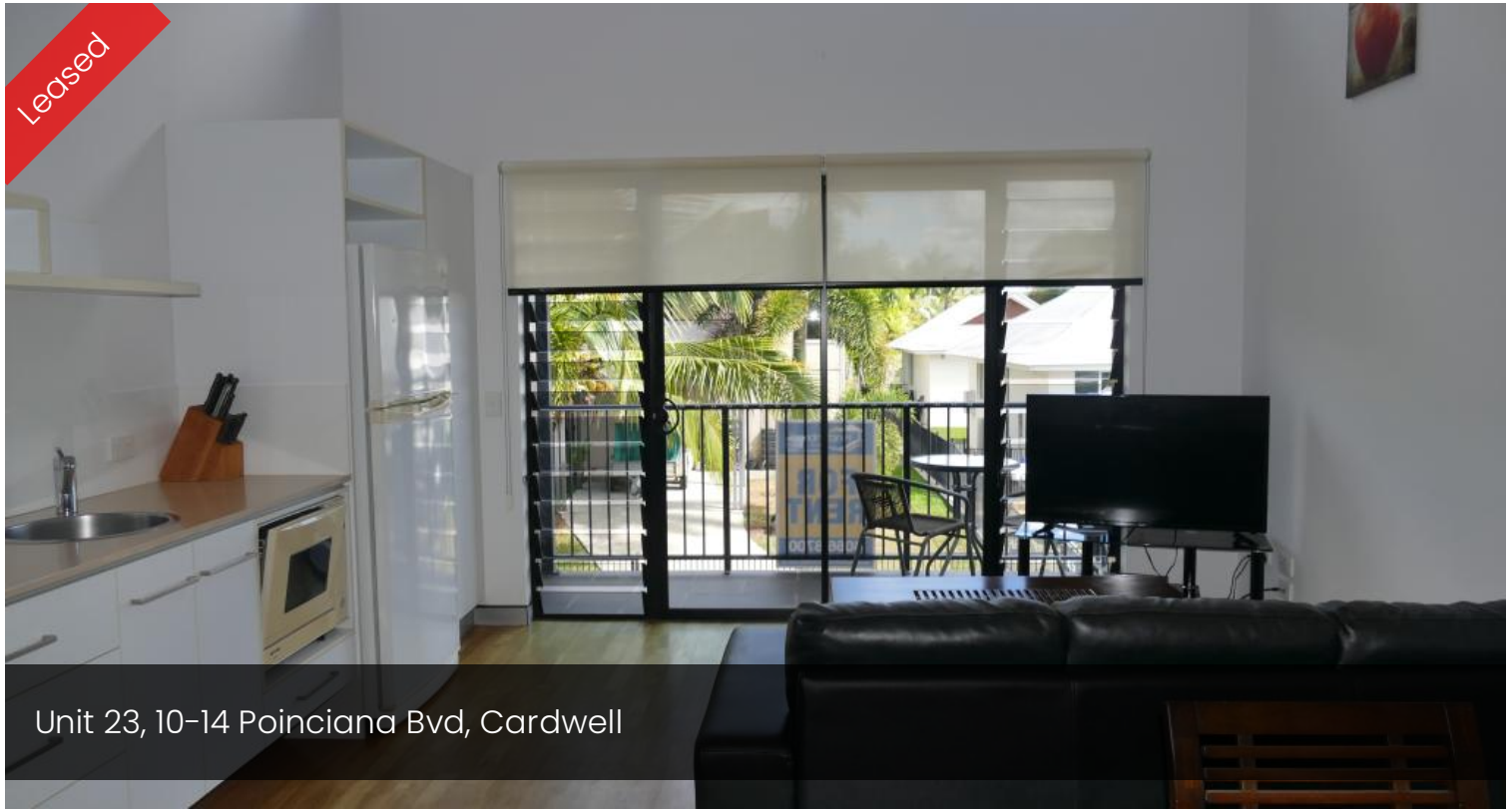
Unit 23, 10-14 Poinciana Bvd, Cardwell