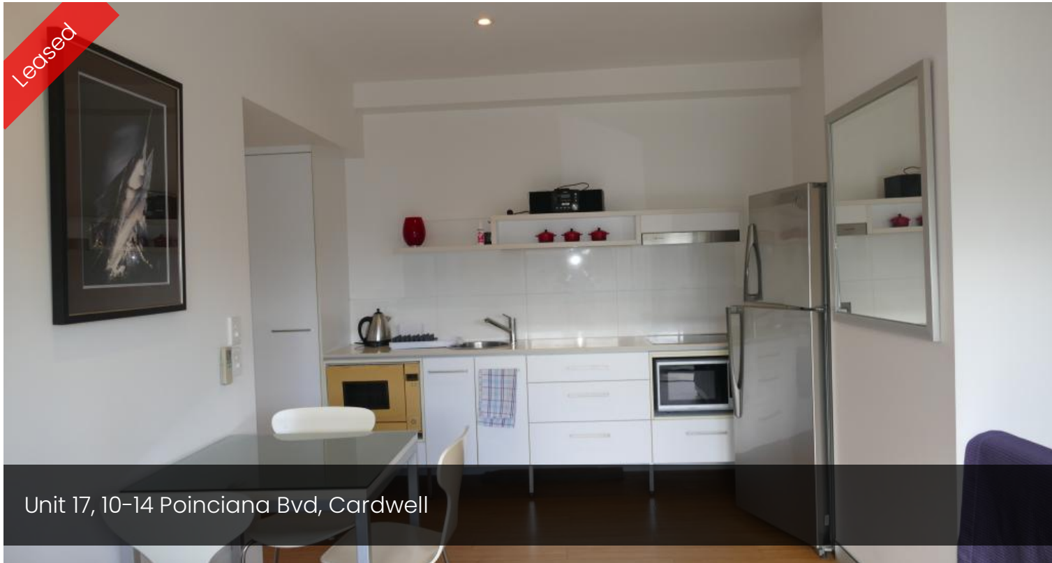
Unit 17, 10-14 Poinciana Bvd, Cardwell