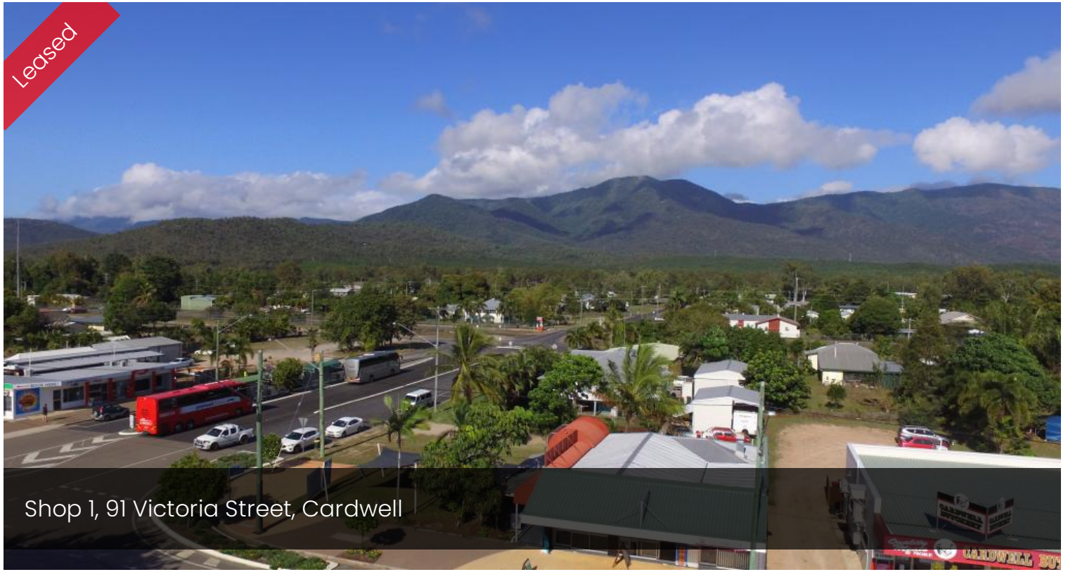
Shop 1, 91 Victoria Street, Cardwell