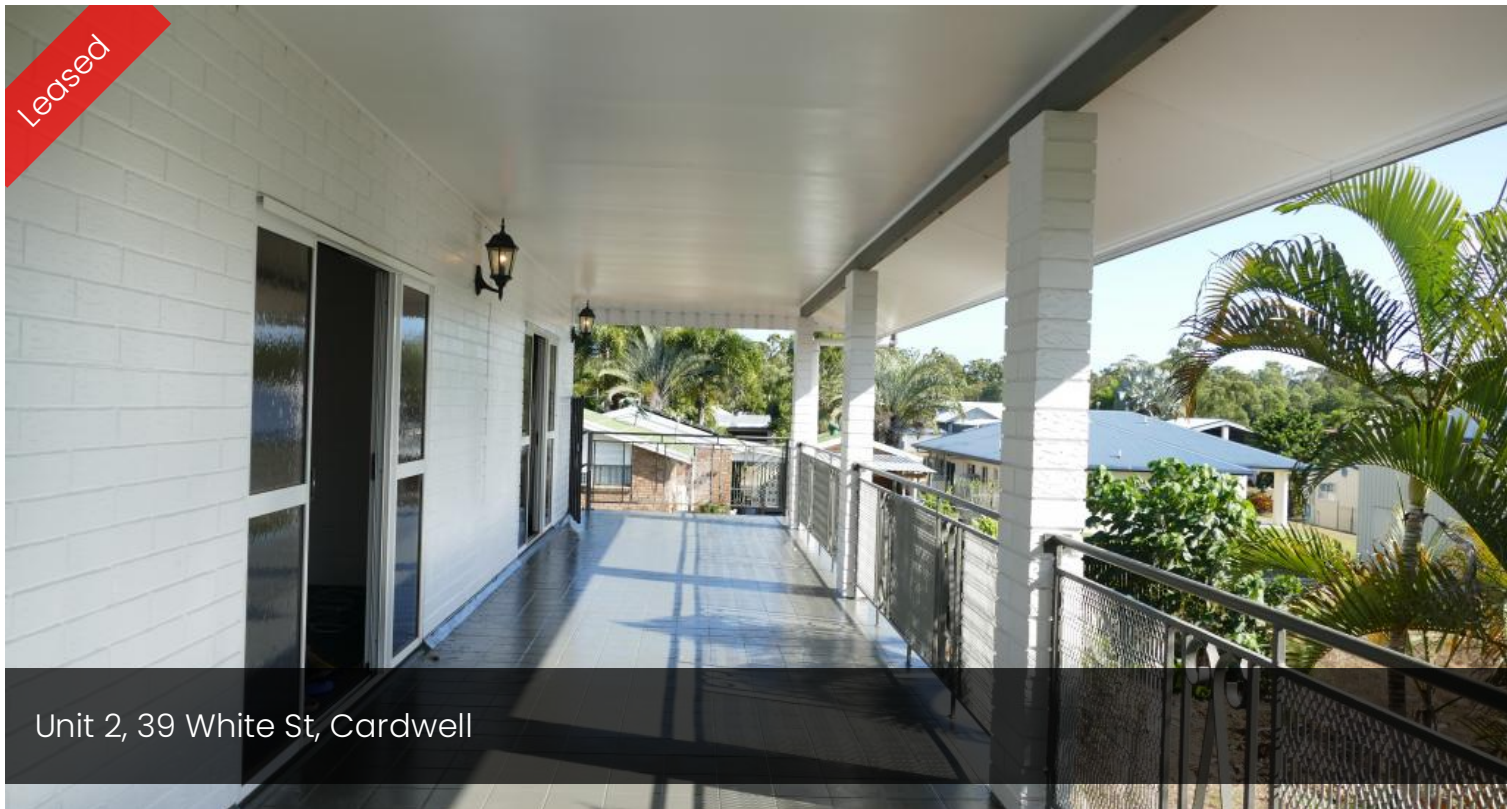
Unit 2, 39 White St, Cardwell