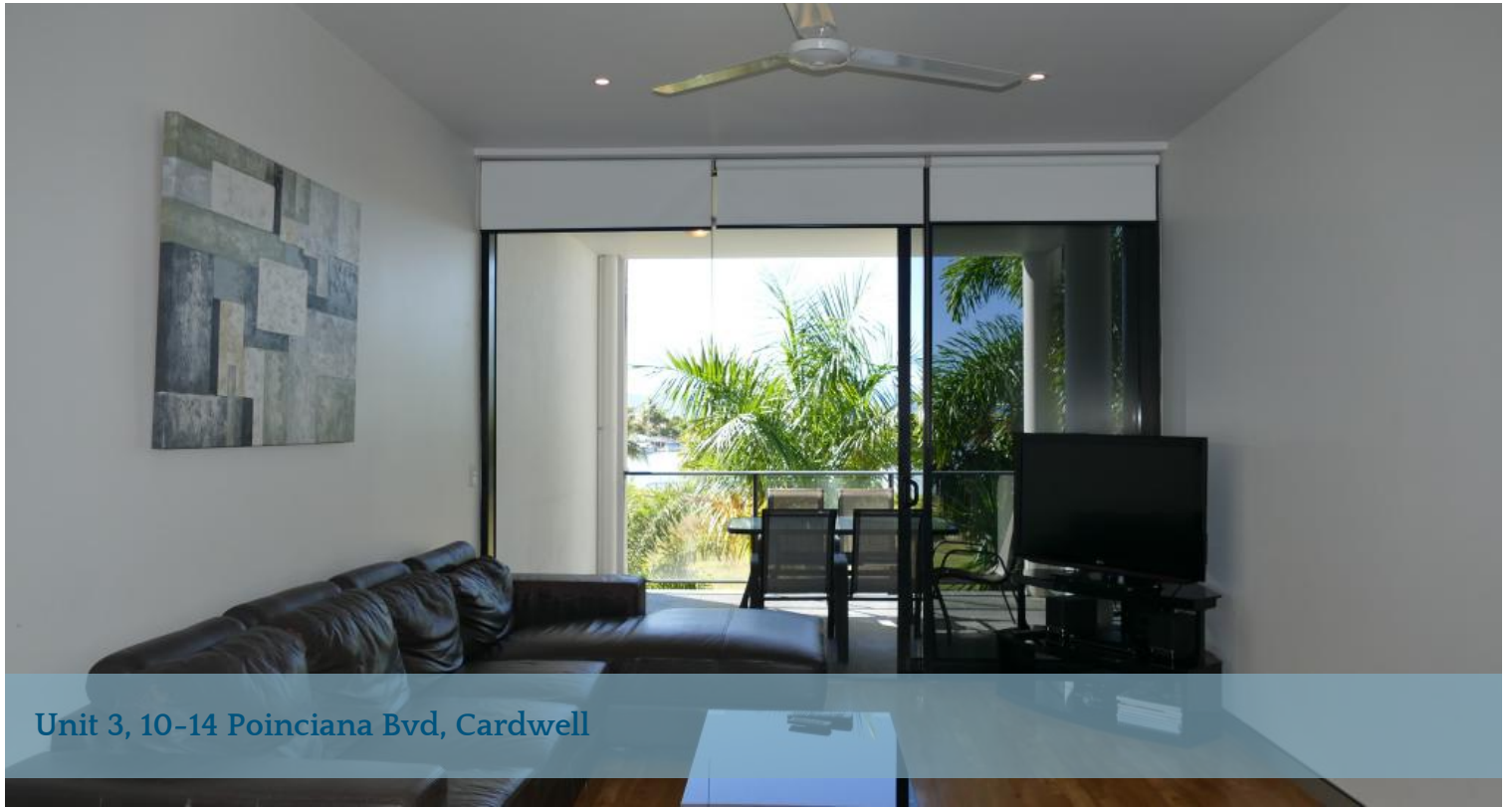
Unit 3, 10-14 Poinciana Blvd, Cardwell