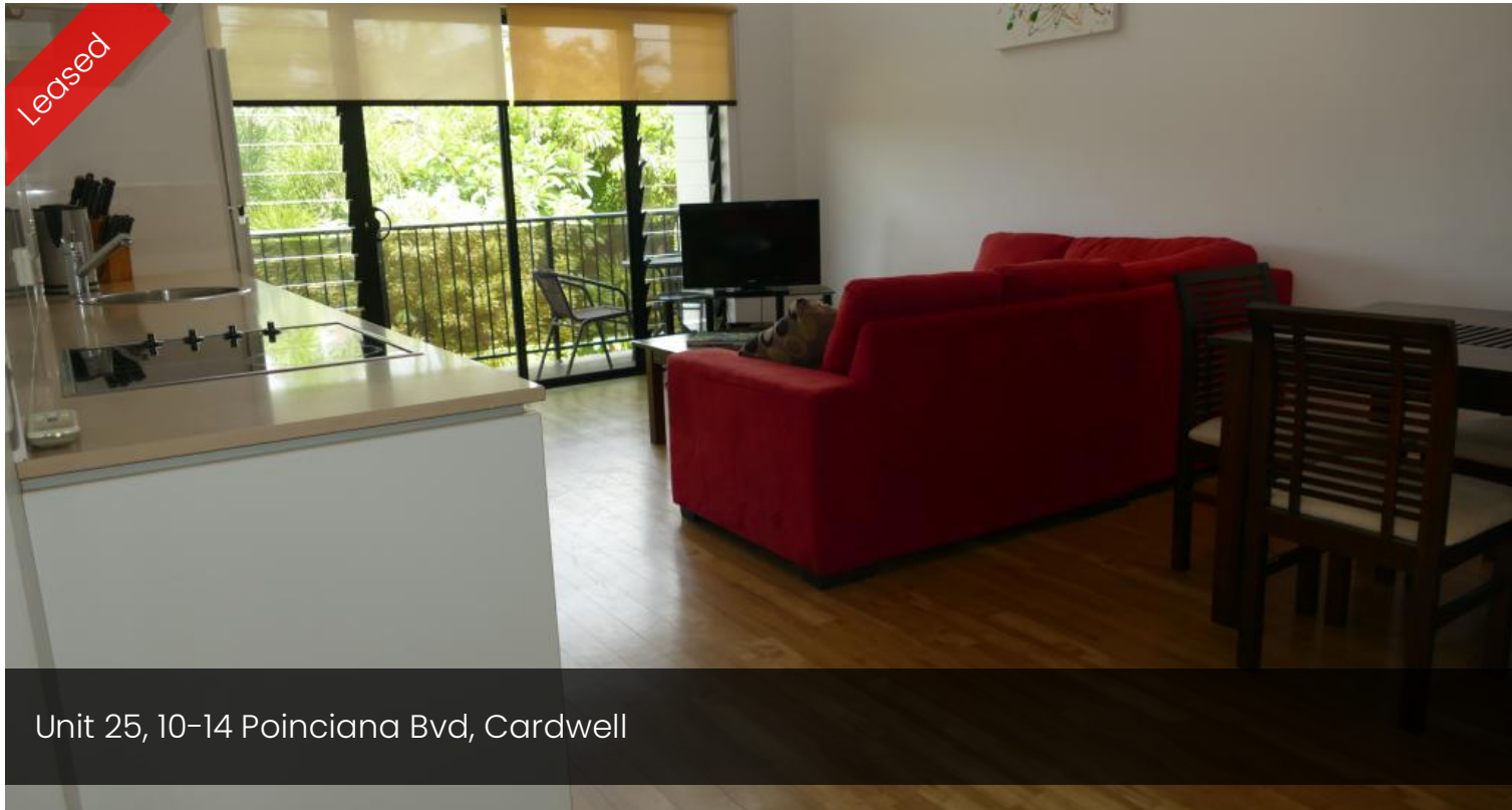
Unit 25, 10-14 Poinciana Bvd, Cardwell