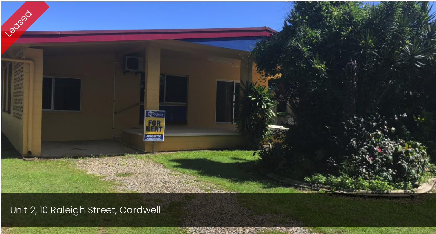
Unit 2, 10 Raleigh Street, Cardwell