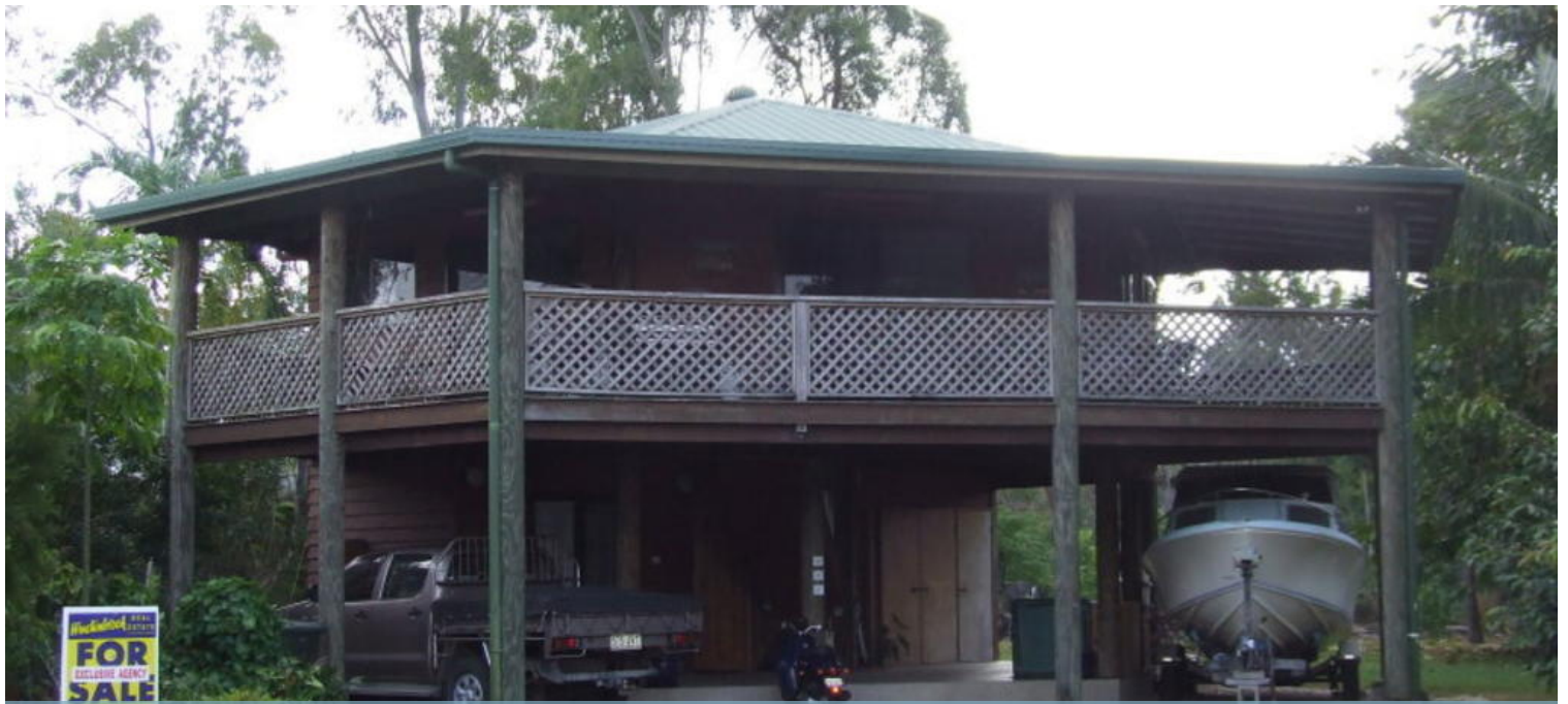
2 Edmondson Close, Cardwell