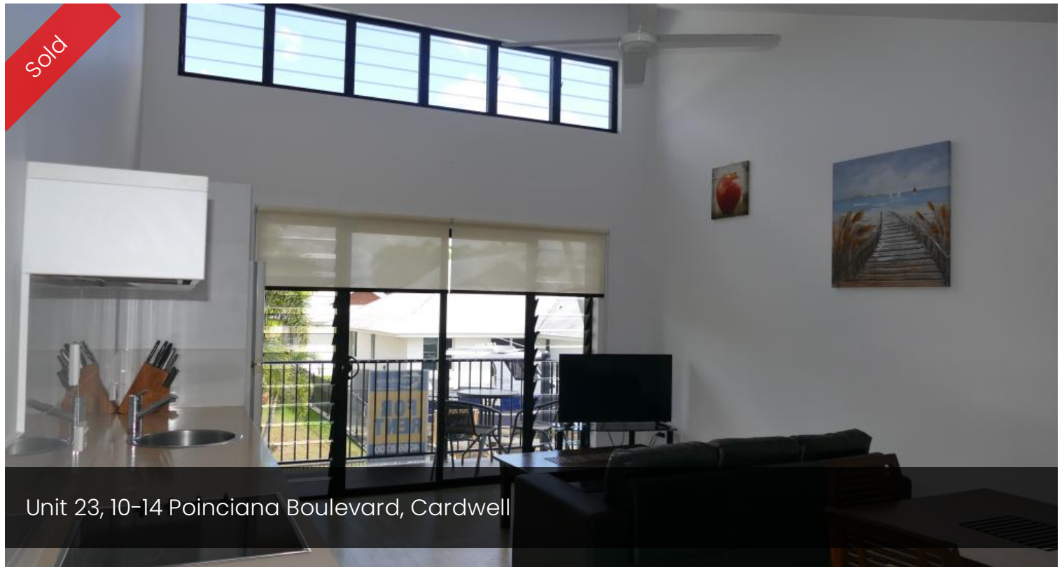
Unit 23, 10-14 Poinciana Boulevard, Cardwell