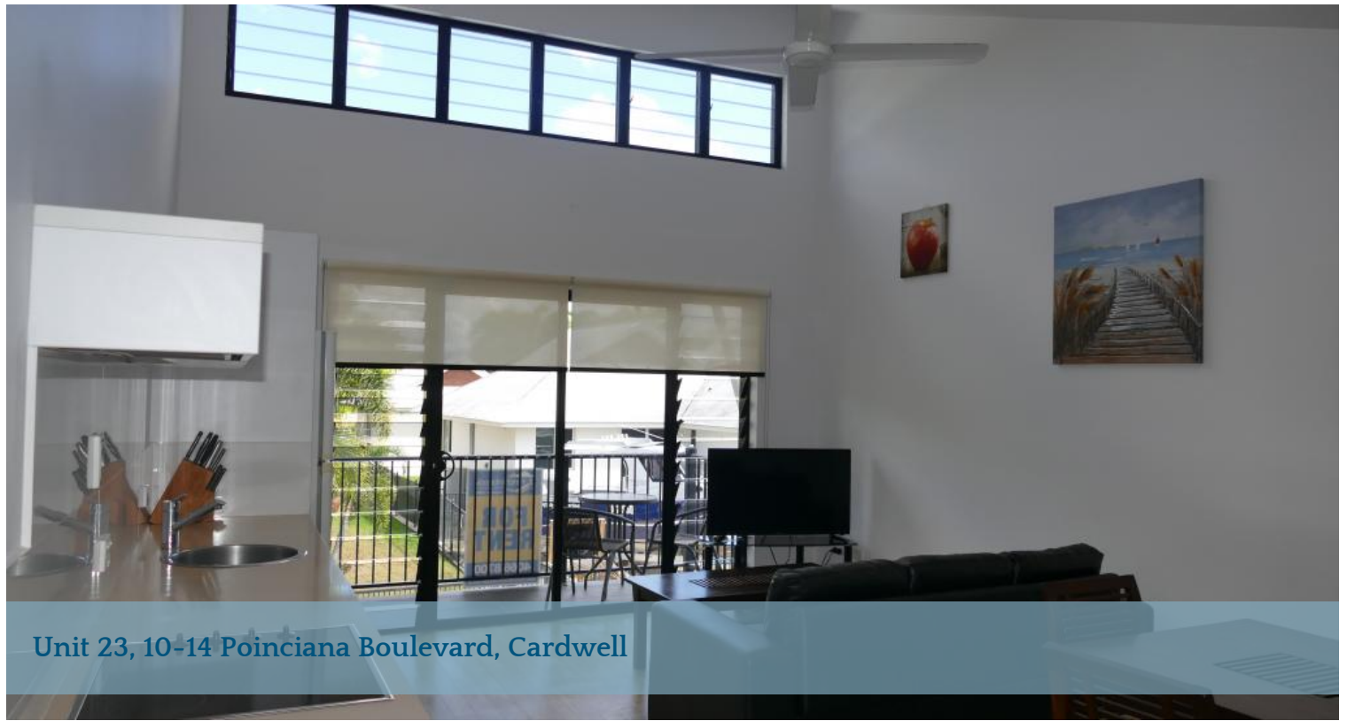
Unit 23, 10-14 Poinciana Boulevard, Cardwell