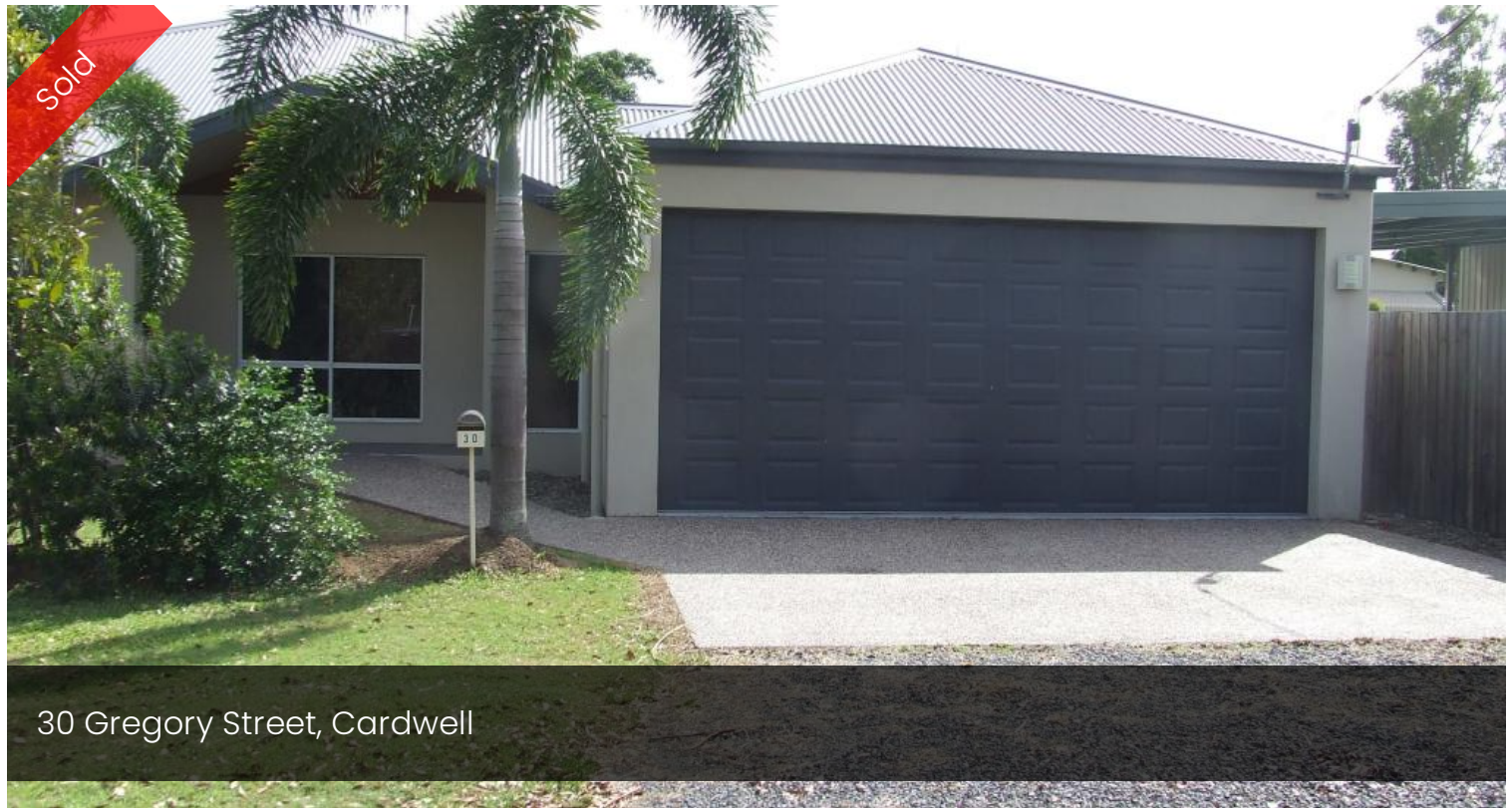
30 Gregory Street, Cardwell