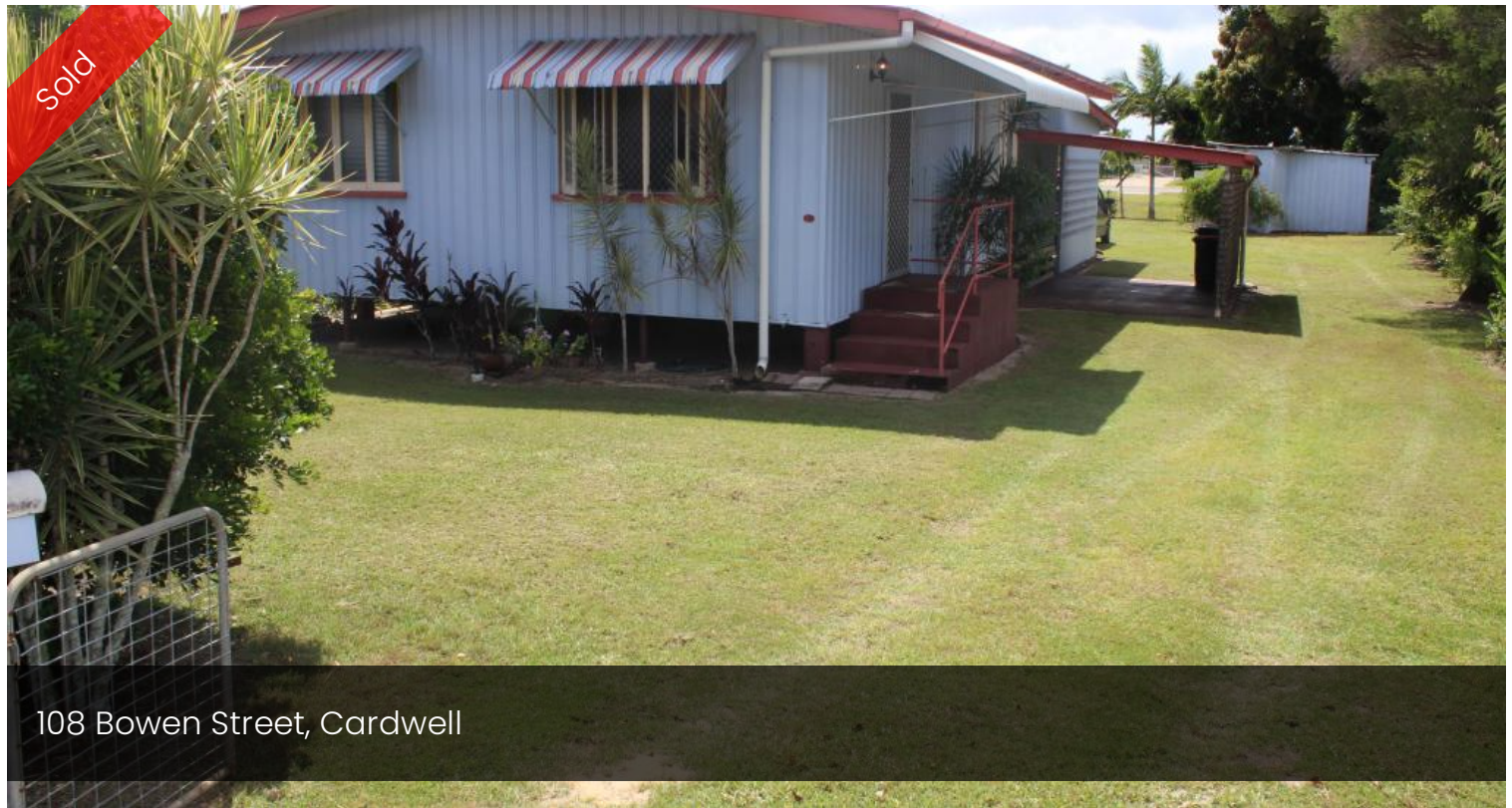
108 Bowen Street, Cardwell