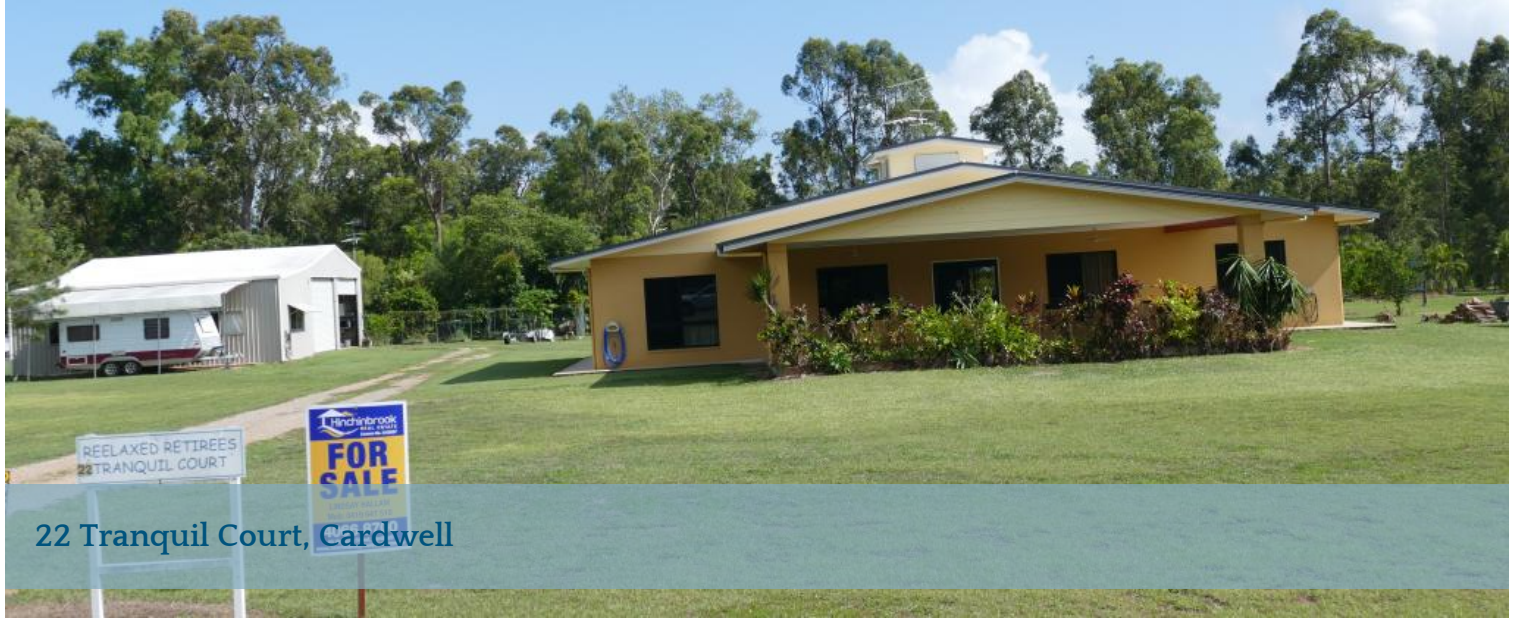
22 Tranquil Court, Cardwell