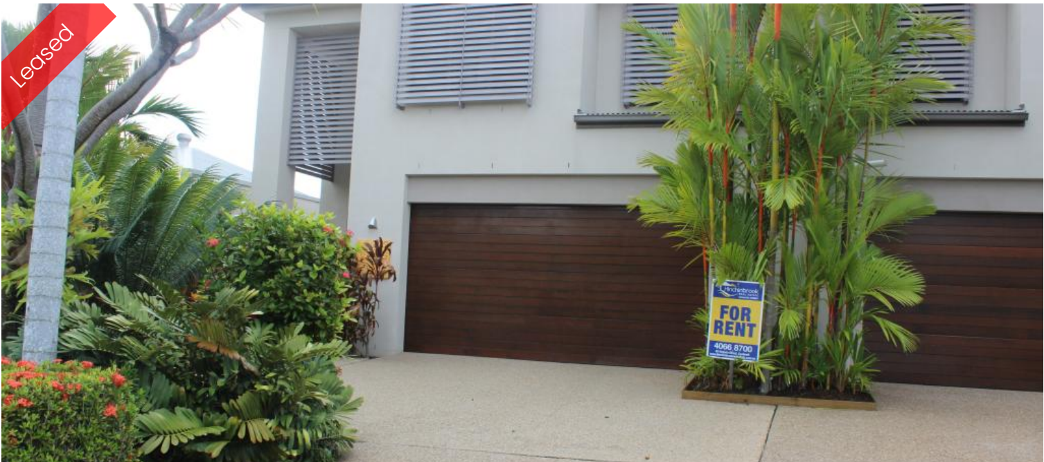
2, 3 ALLAMANDA Lane, Cardwell