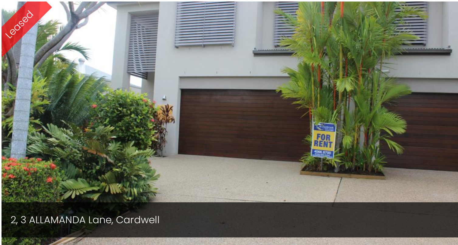
2, 3 ALLAMANDA Lane, Cardwell