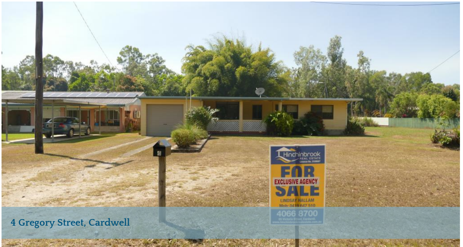
4 Gregory Street, Cardwell