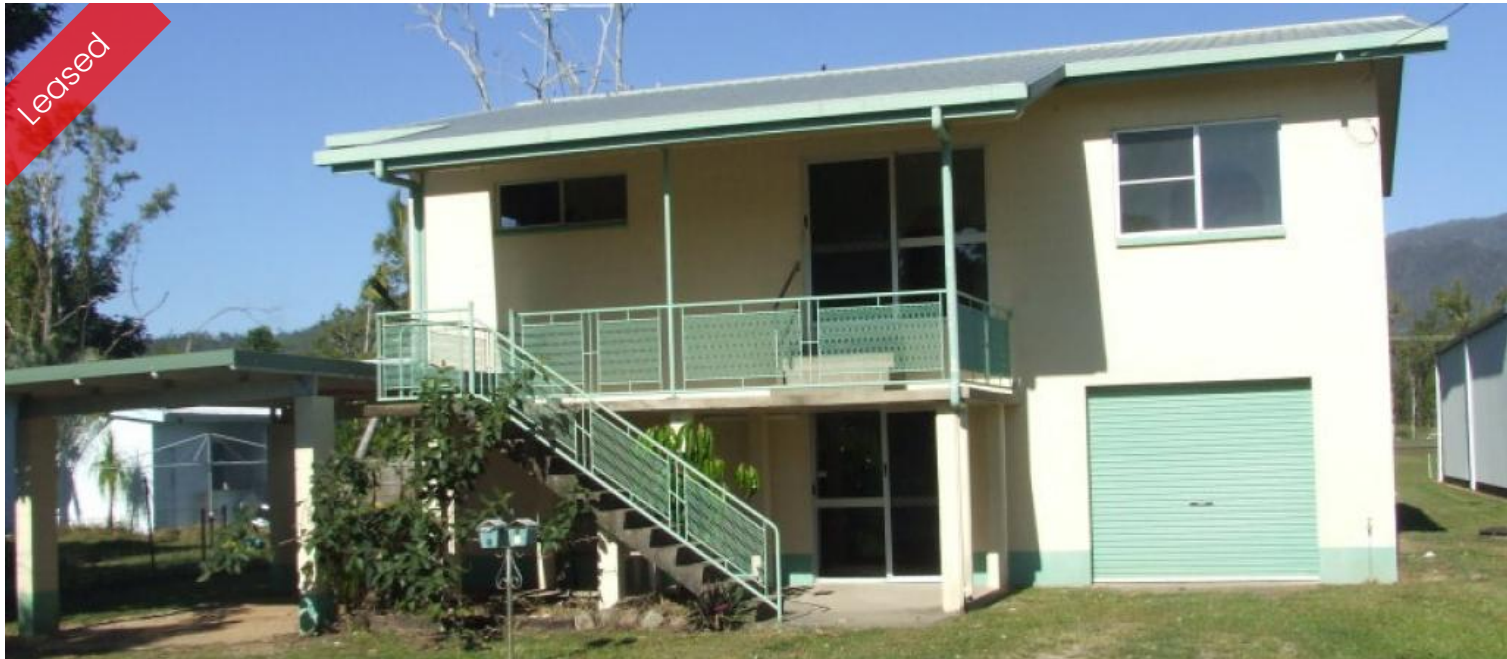
Unit 1, 71 Roma Street, Cardwell