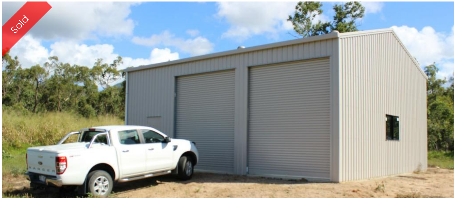
Lot 14 Pleasant Drive, Cardwell