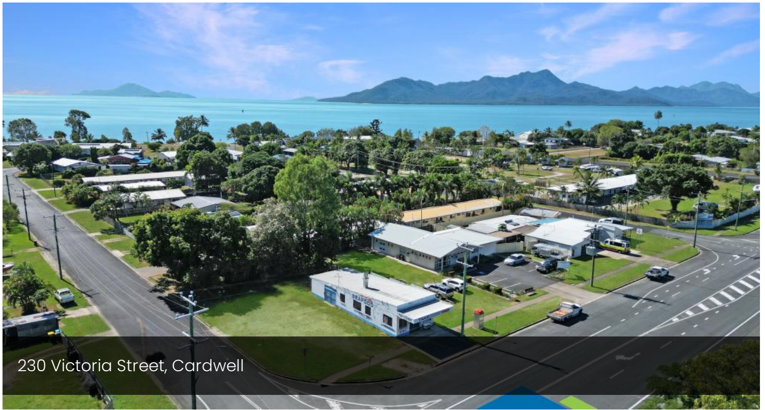
230 Victoria Street, Cardwell