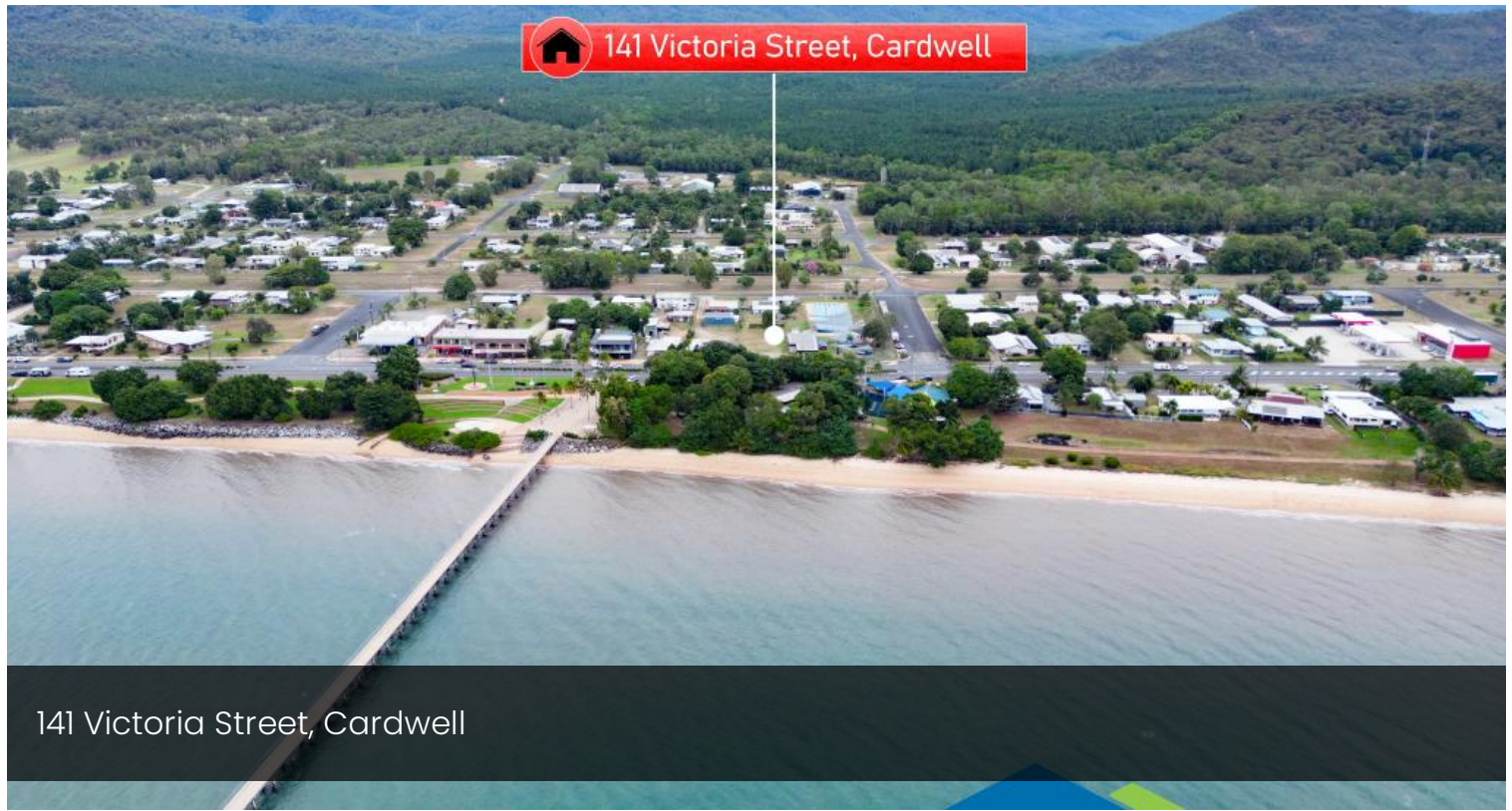
141 Victoria Street, Cardwell