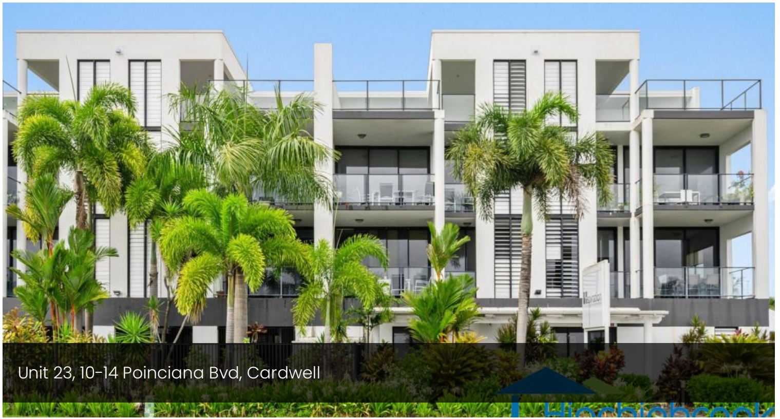
Unit 23, 10-14 Poinciana Blvd, Cardwell