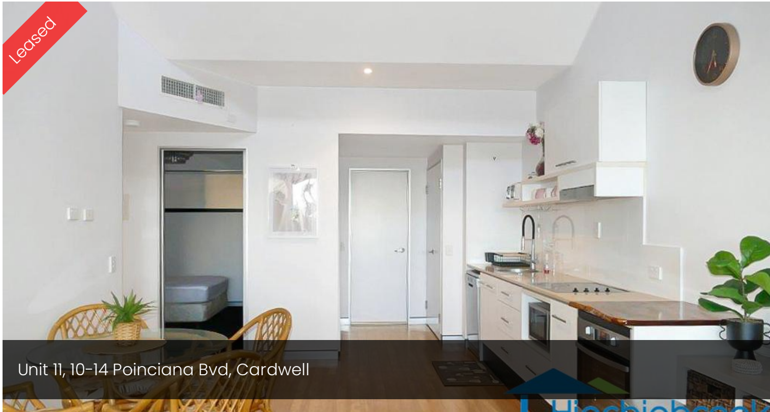
Unit 11, 10-14 Poinciana Bvd, Cardwell