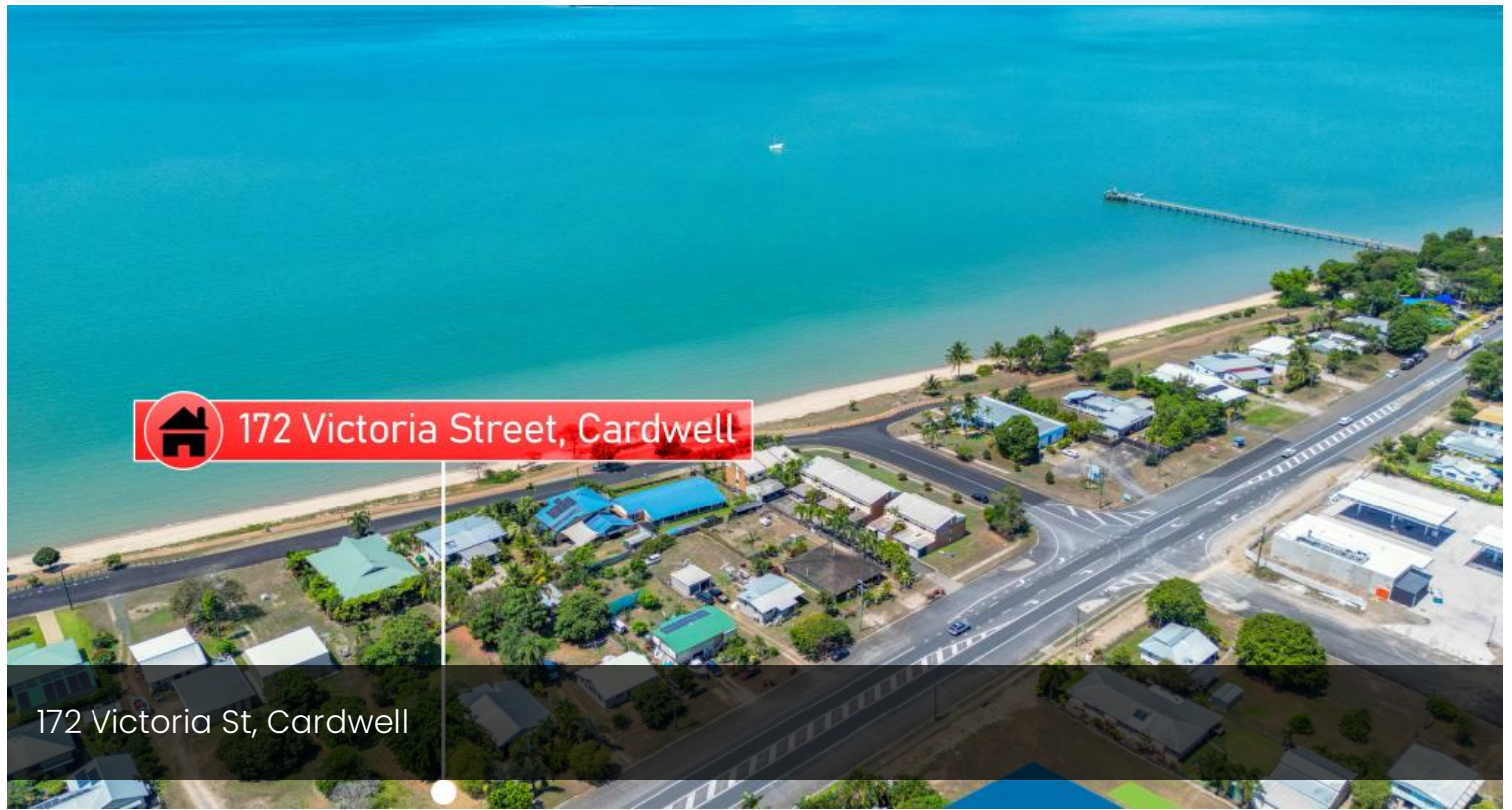
172 Victoria St, Cardwell