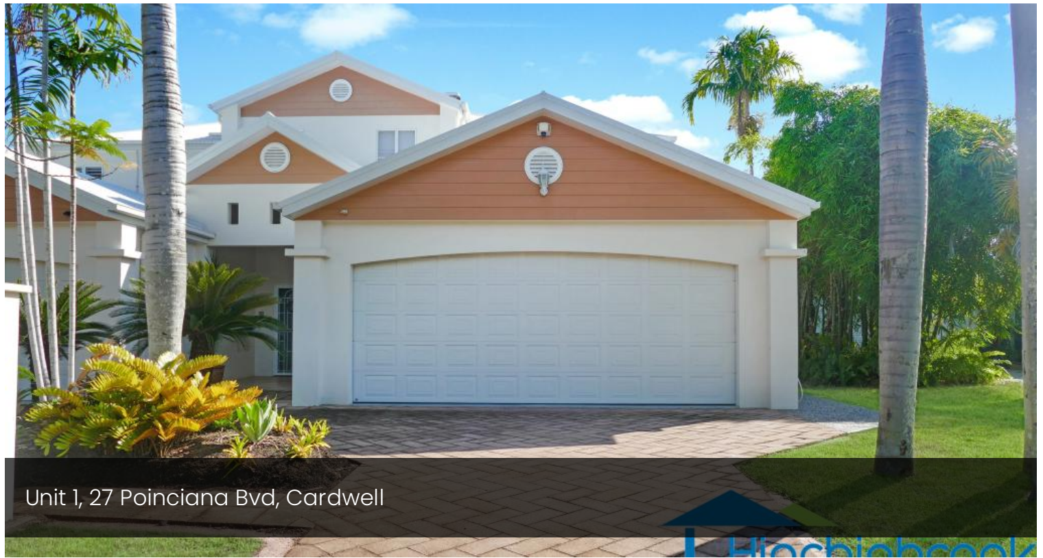
Unit 1, 27 Poinciana Blvd, Cardwell