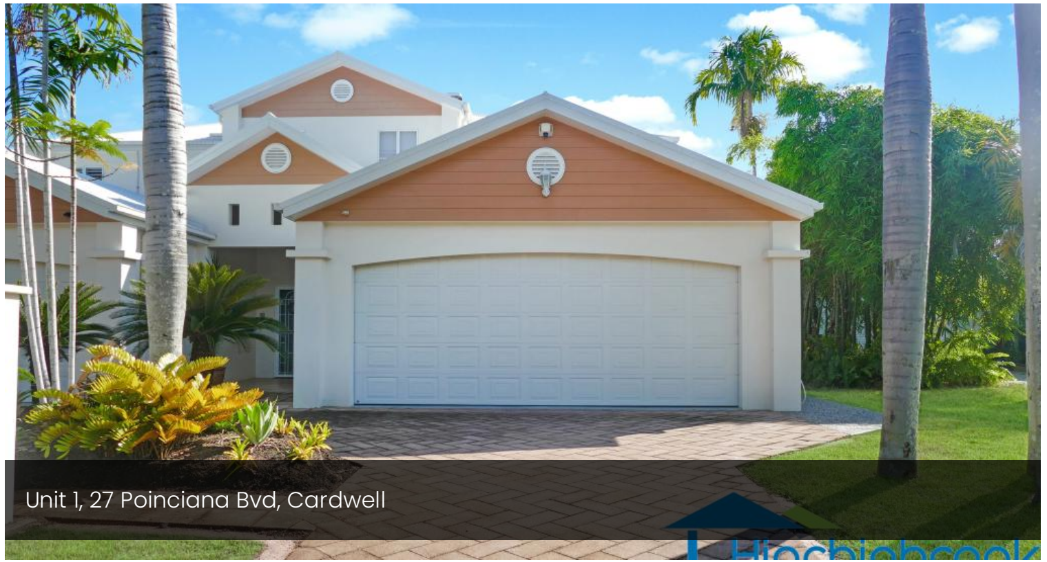
Unit 1, 27 Poinciana Blvd, Cardwell